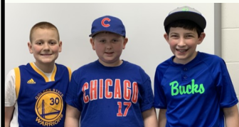
BIRDS' Celebration: Hobbies (more photos next week)